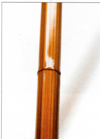
Intermediate whipping, a single turn of claret silk, neatly nods to classic rods which often had intermediate whippings.