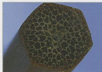
CROSS-SECTION OF LAMINATED BAMBOO; THE COMPLETED BLANK PART.