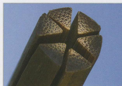
MILLED AND TAPERED BAMBOO SECTIONS READY TO BE GLUED INTO A HEXAGONAL BLANK.