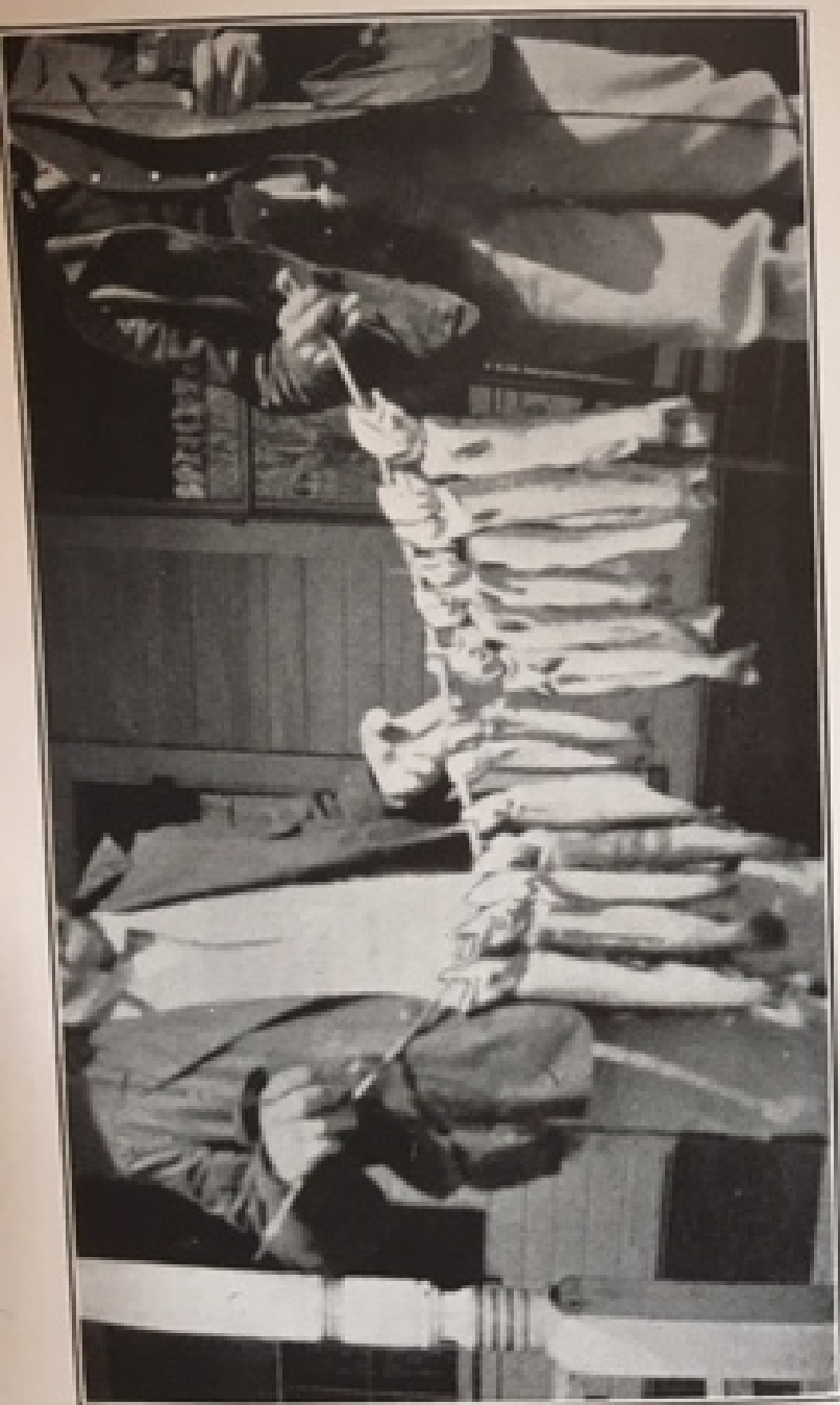
A fine catch of trout on the Beaverkill, at Roscoe, N. Y., 1925—Payne Fly Rod Used.