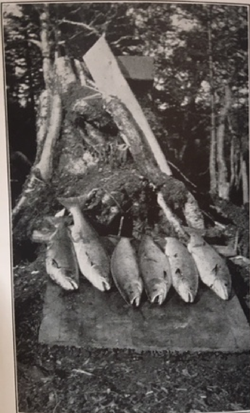
Catch of Salmon—Payne Salmon Rod Used.