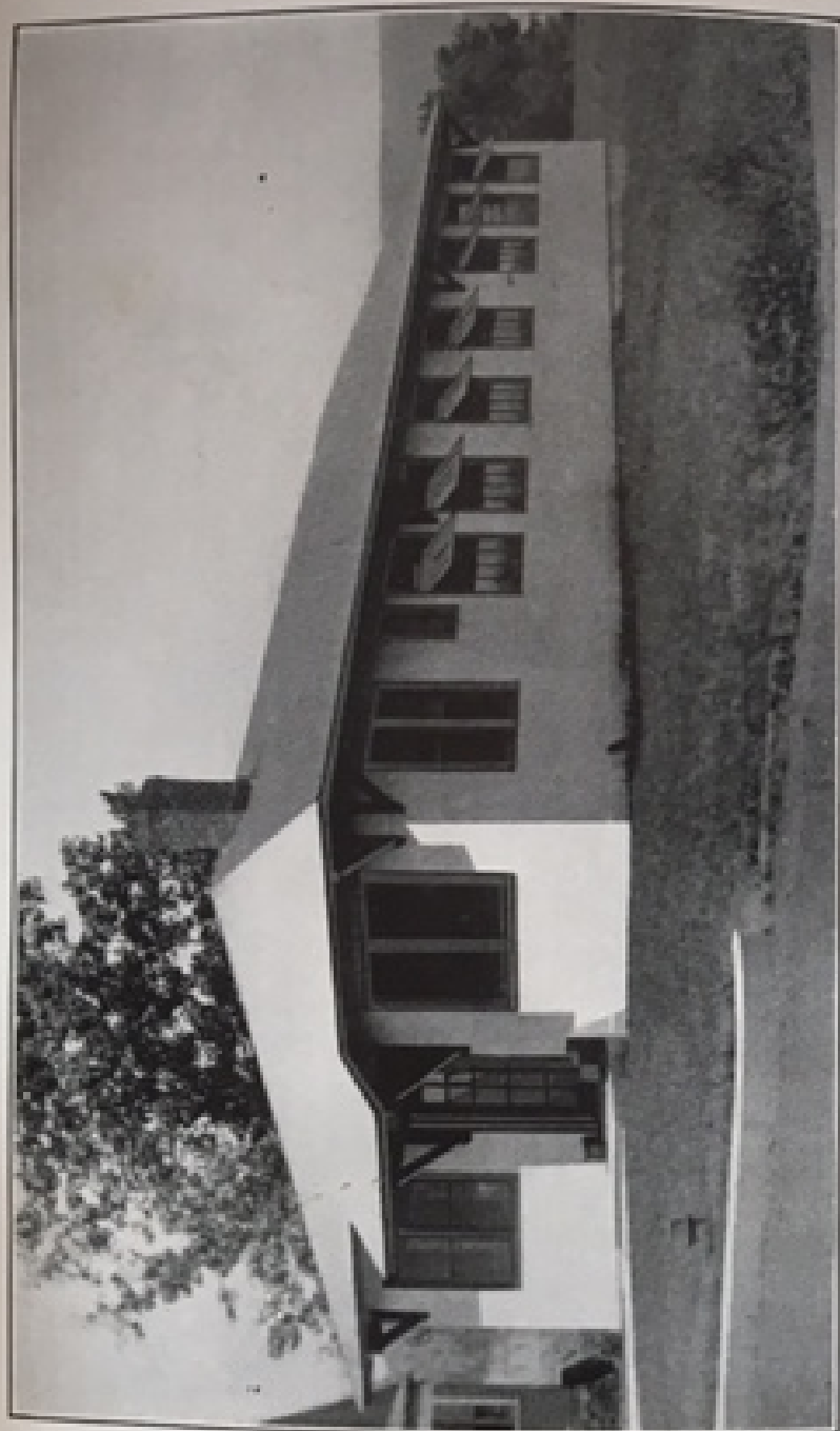
The Home of Payne Rods