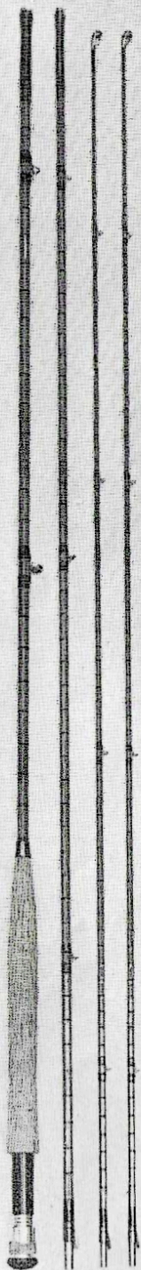
The Fair City